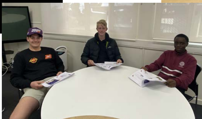
Some of our Students participated in the White Card training for Construction that was held on Tuesday, July 4th.